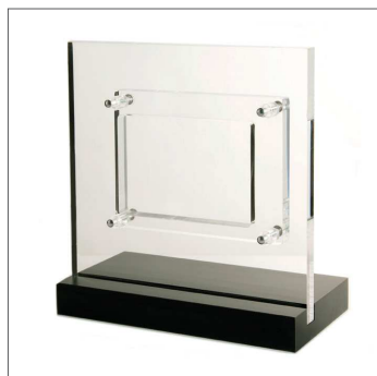
SQUARE OR RECTANGULAR TRANSPARENT