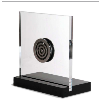
ROUND STAINLESS STEEL

Heavy duty stainless steel with brushed finish